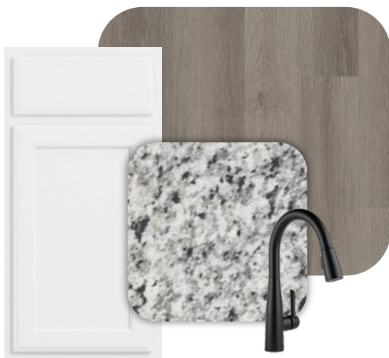
Granite Countertops LVP Floors