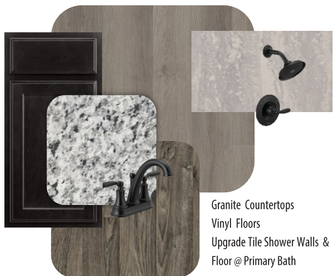
LL Bath Vinyl